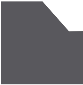
EDGE CHAMFERED EDGE DETAIL