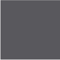
EDGE ZERO EDGE DETAIL